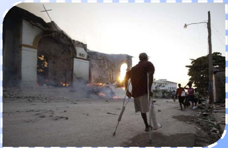
The Shrine of Our Lady of Perpetual Help after the earthquake of January 12, 2010.